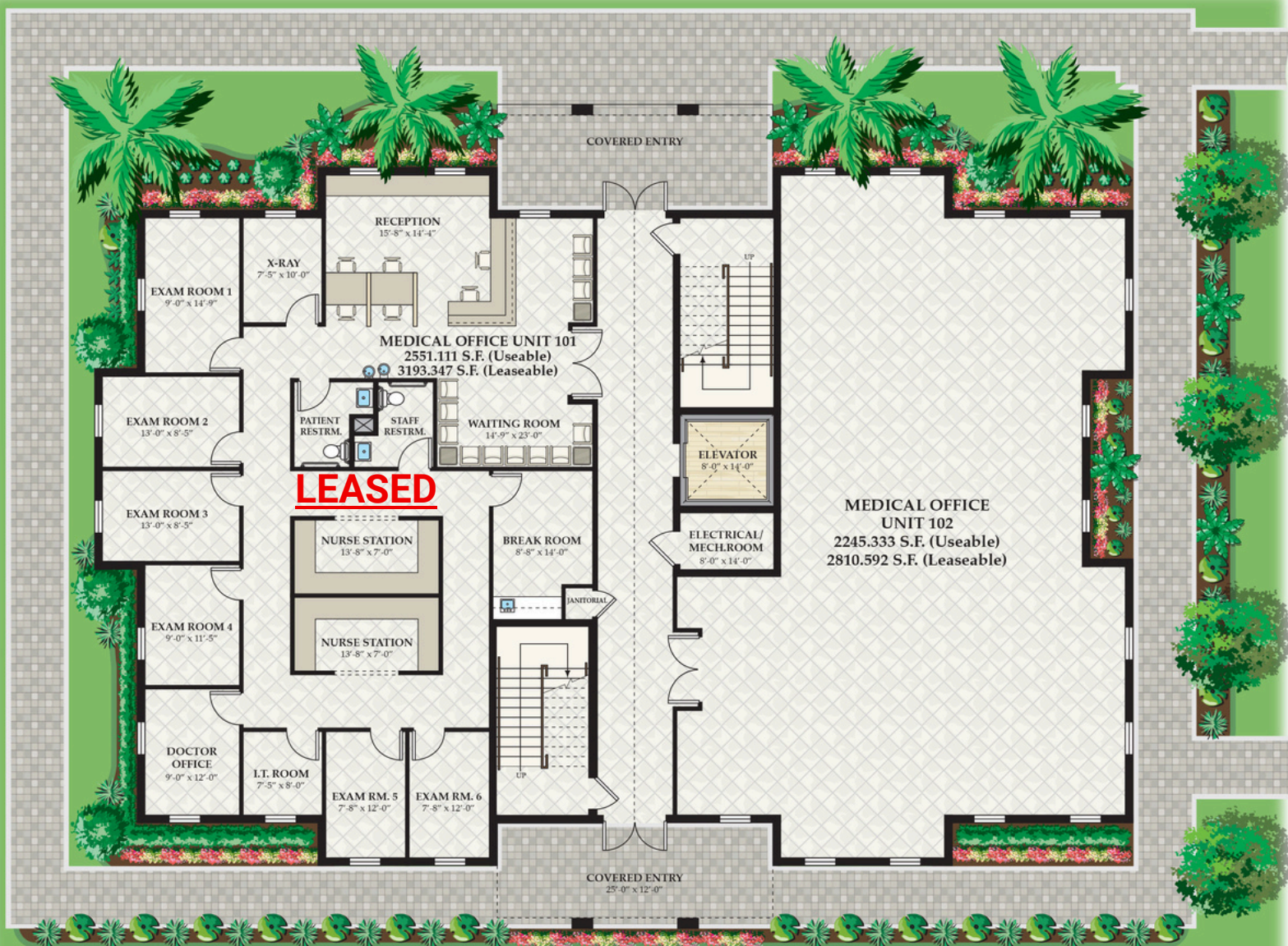
VANDERBILT PROFESSIONAL CENTER MEDICAL BUILDING 1ST LEVEL FLOOR PLAN

Suite 102 - 2245.333 SF Usable - 2810.592 SF Leasable