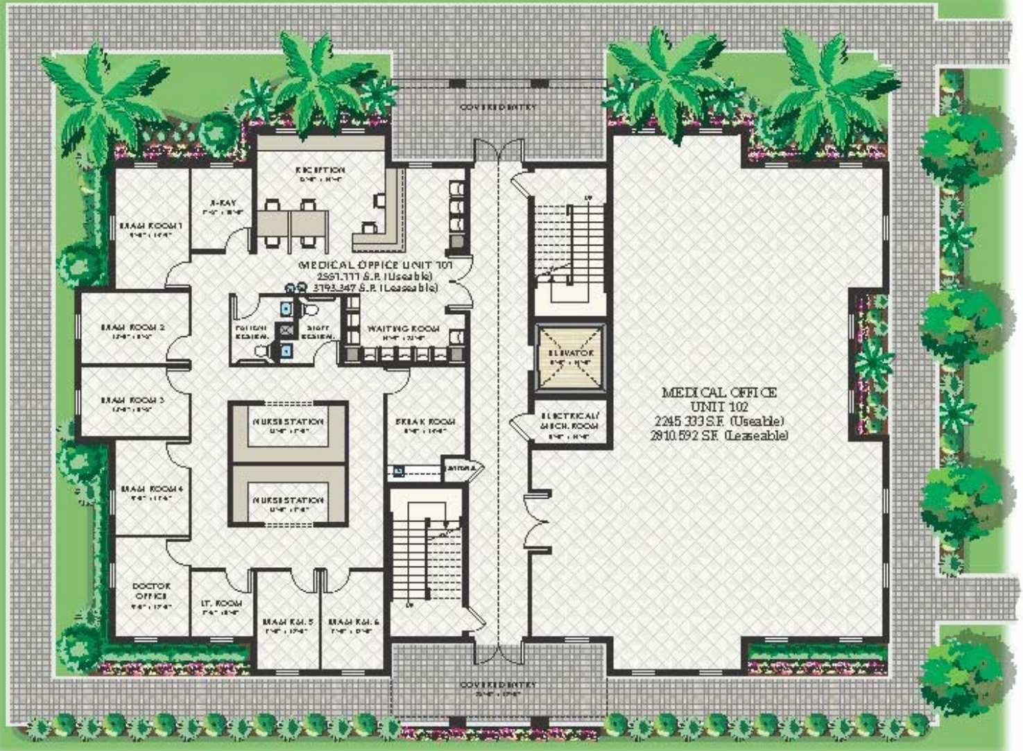
VANDERBILT PROFESSIONAL CENTER MEDICAL BUILDING 1 ST LEVEL FLOOR PLAN